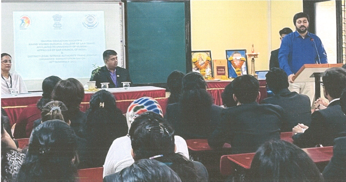
Constitution Day Celebration at Anand Vishwa Gurukul College of Law

Tel.: 9967589008 • Email : avgcollegeoflaw@gmail.com