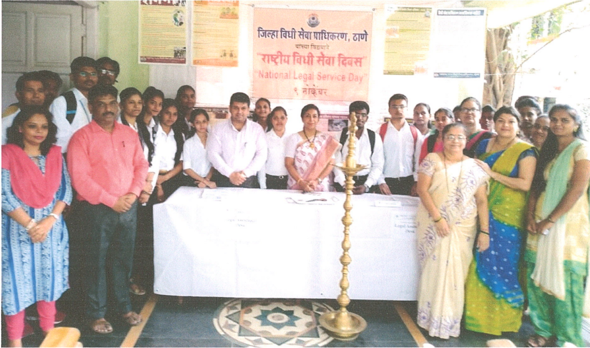
National Legal Service Day Celebration at Anand Vishwa Gurukul College of Law

Tel.: 9967589008 • Email : avgcollegeoflaw@gmail.com